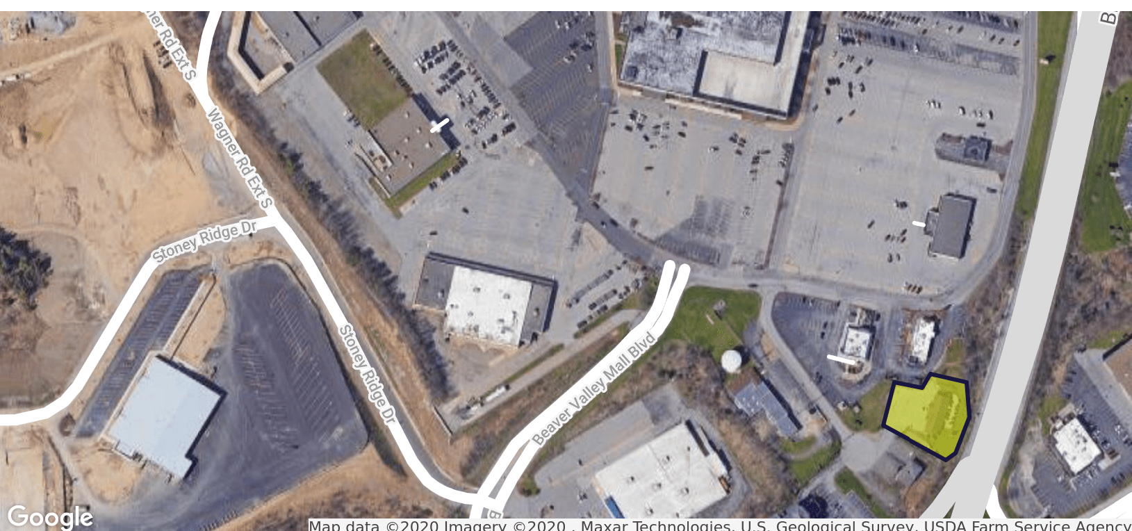
Map data ©2020 Imagery ©2020 , Maxar Technologies, U.S. Geological Survey, USDA Farm Service Agency