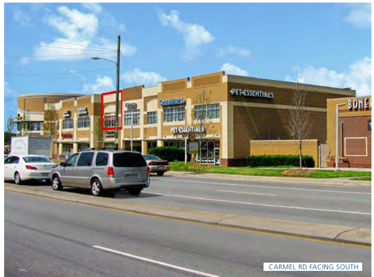
CARMEL RD FACING SOUTH