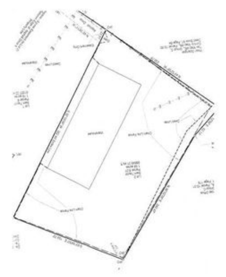
3522 Brown Plat Lincoln