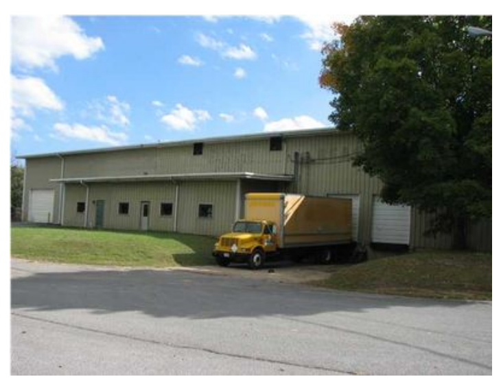
3522 Brown-Front Side View Lincoln