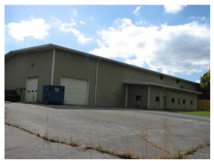
3522 Brown End View Lincoln