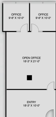
Suite 350 920 RSF