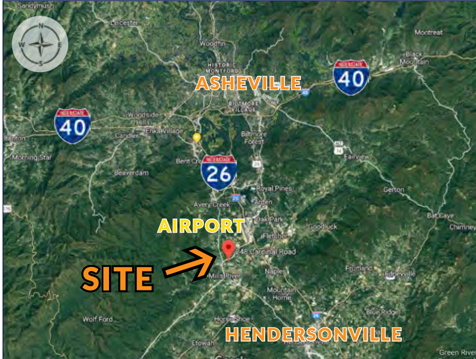
Regional map showing this location in relation to Hendersonville and Asheville, as well as proximity to the Asheville Regional Airport

248 Cardinal Road, Mills River, NC 28759