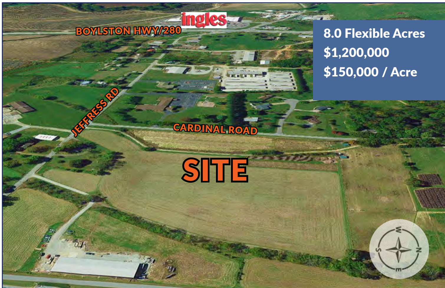
Just off Boylston Hwy/280 at the Ingles, this lot at 248 Cardinal Road allows for some flexible planning

Mills River Acreage is 0.4 Miles from High-Traffic HWY 280