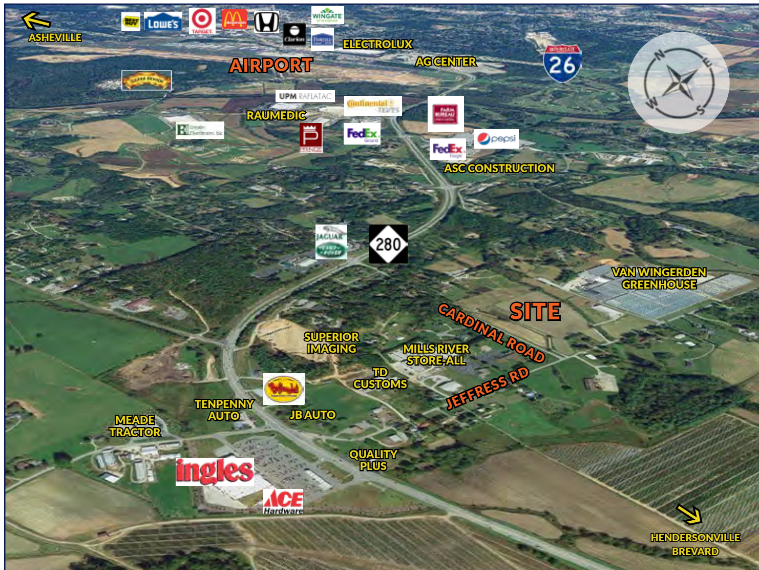
Cardinal Road is near many large industries along the Boyleston Hwy/280 business corridor

MUNICIPALITY: MILLS RIVER COUNTY: HENDERSON ZONING: MR_MU TYPE: RETAIL DEED BOOK, PAGE: 1455, 589 PIN #: 9632-80-8048