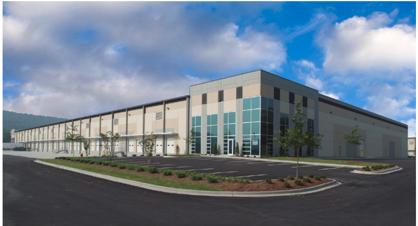
▲ Building #2

Sonny Culp, SIOR 205.871.7100 sonnyc@grahamcompany.com