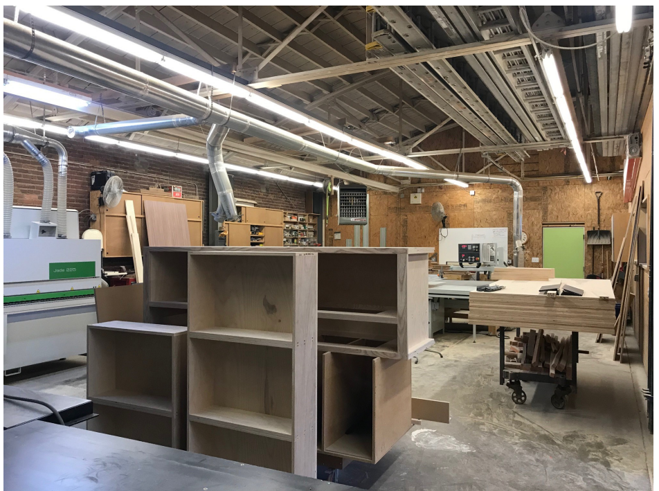
3,445 square feet of warehouse space.