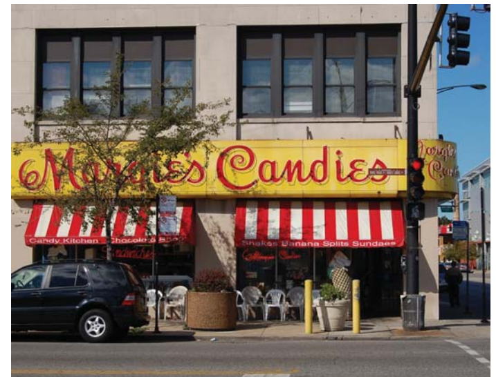
Chicago's famed Margie's Candies est. 1921