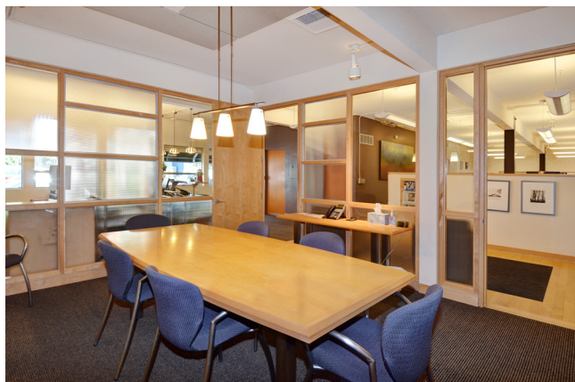
Second floor: Main reception area