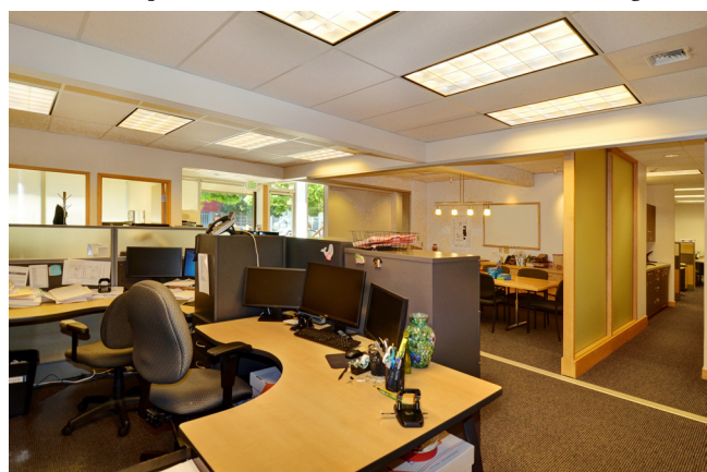
First Floor: Office