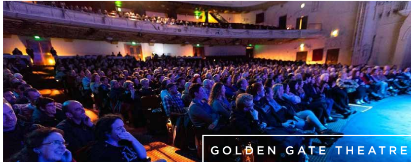
GOLDEN GATE THEATRE