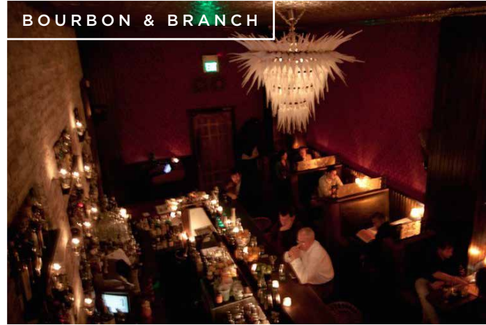
BOURBON & BRANCH