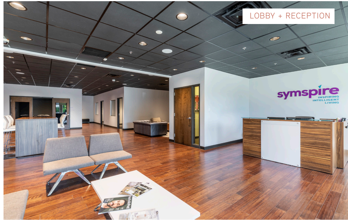
LOBBY + RECEPTION