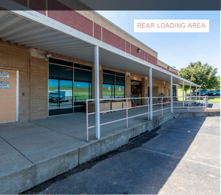
REAR LOADING AREA