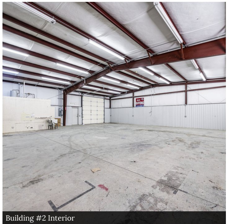
Building #2 Interior