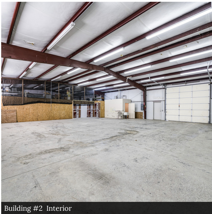
Building #2 Interior