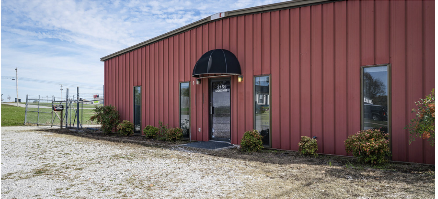
Building #1 Exterior

BUILDING #1 | 2151 Denton Avenue, Cookeville, TN 38501