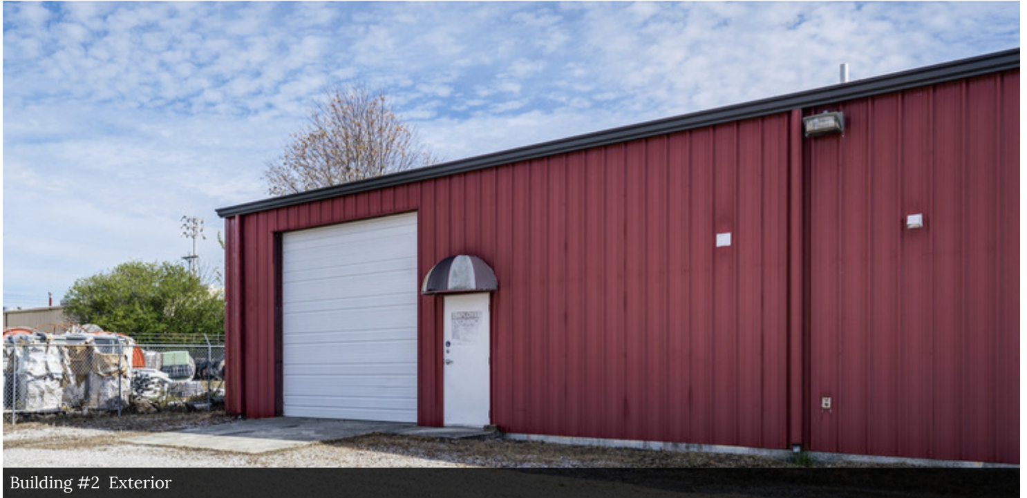
Building #2 Exterior

BUILDING #2 | 2151 Denton Avenue, Cookeville, TN 38501