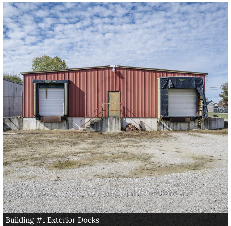
Building #1 Exterior Docks