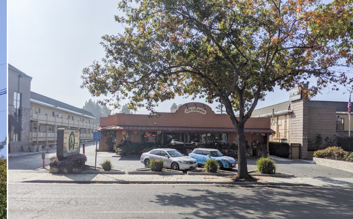
FRONT VIEW - EL CAMINO REAL