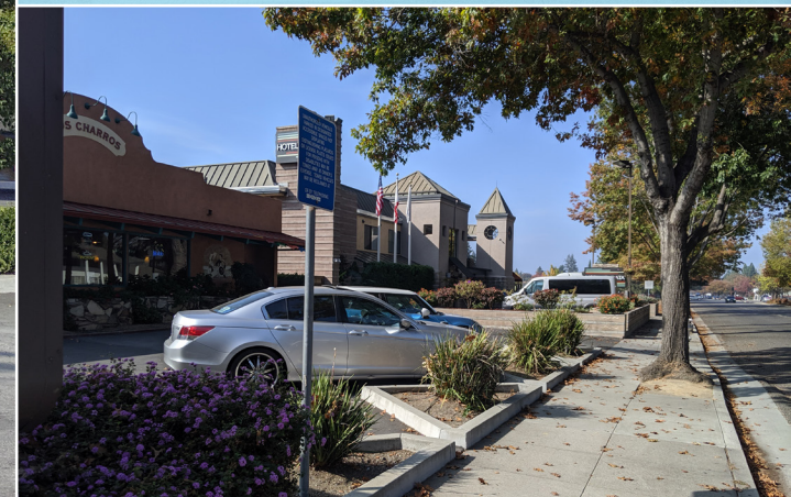
FRONT VIEW - EL CAMINO REAL LOOKING NORTH