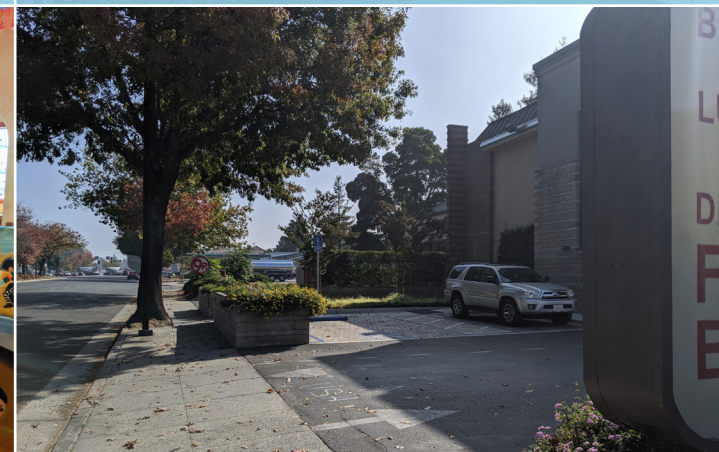
FRONT VIEW - EL CAMINO REAL LOOKING SOUTH