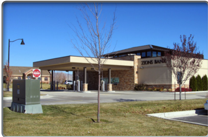
NWC of Redwood Road, State Rd. 73 Saratoga Springs, Utah