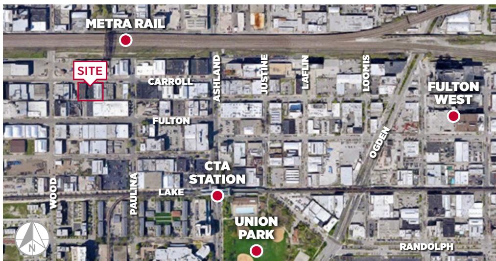
Kinzie Corridor | Chicago, IL