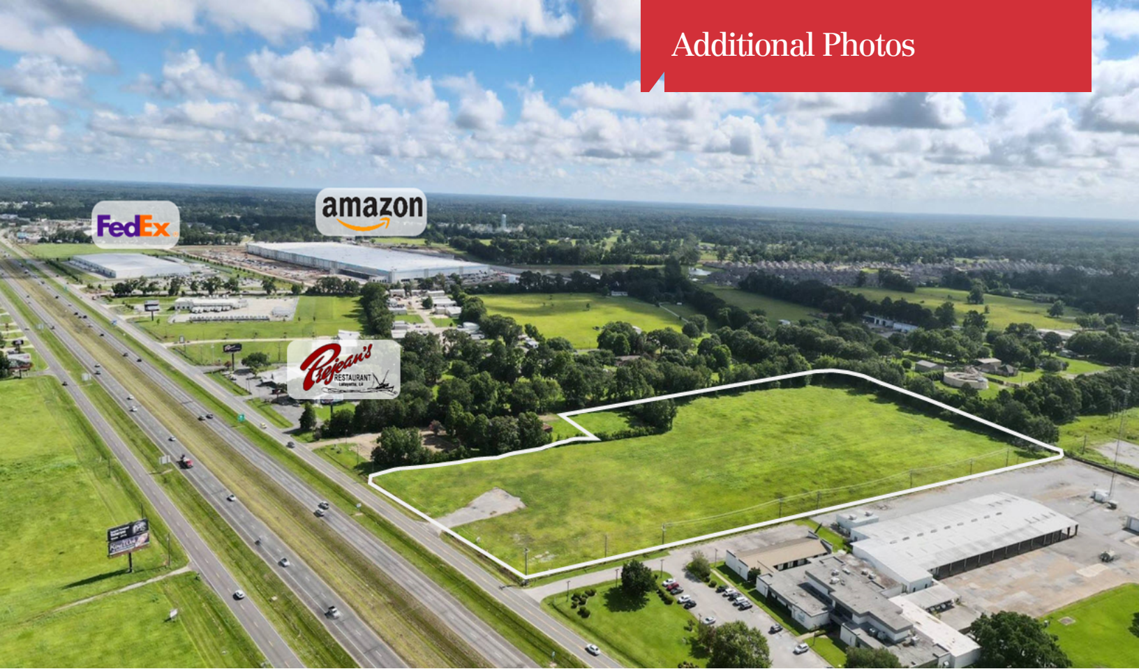
Lots drawn for visual purposes only, not to scale