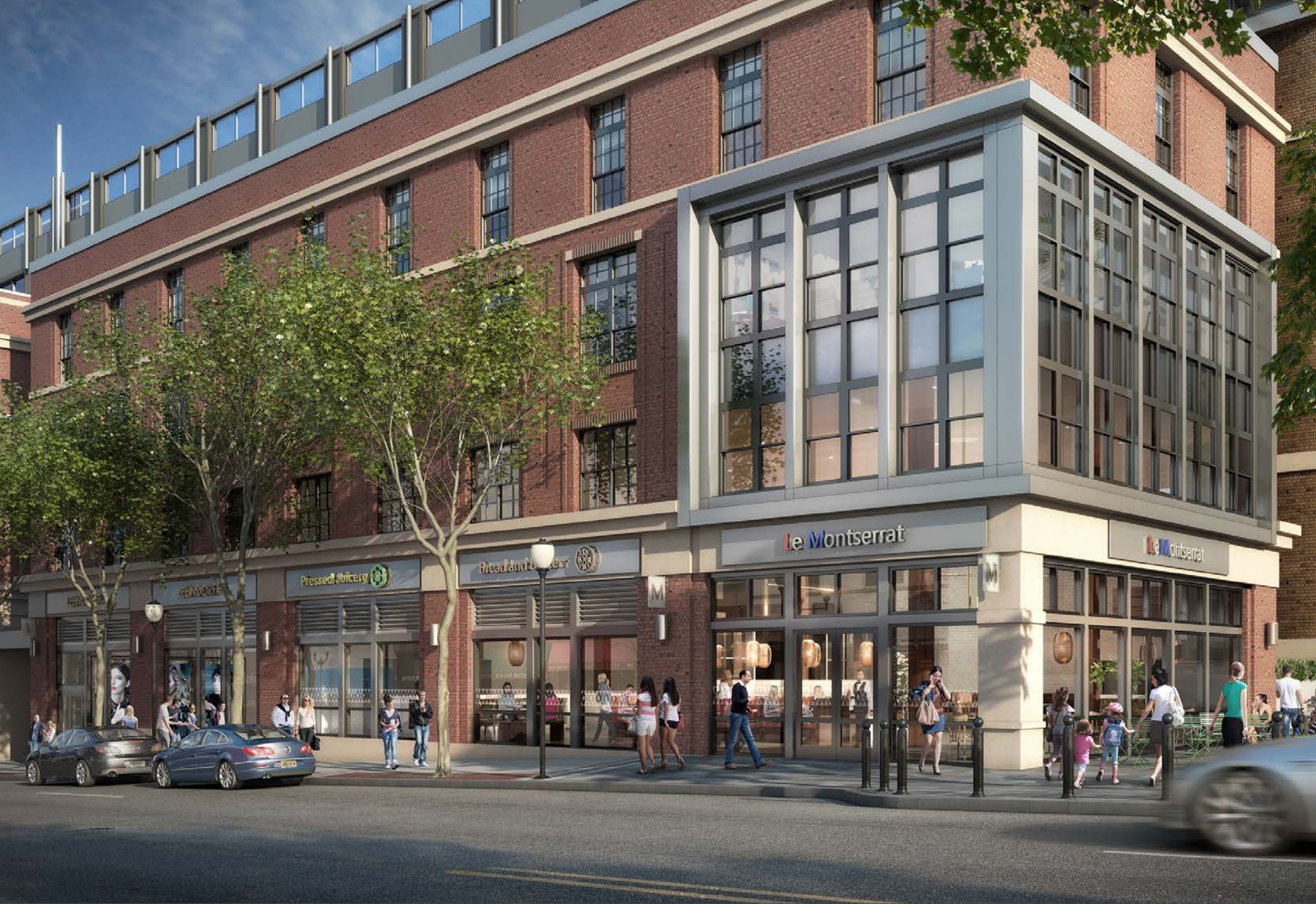
SEYMOUR STREET MONTCLAIR, NEW JERSEY