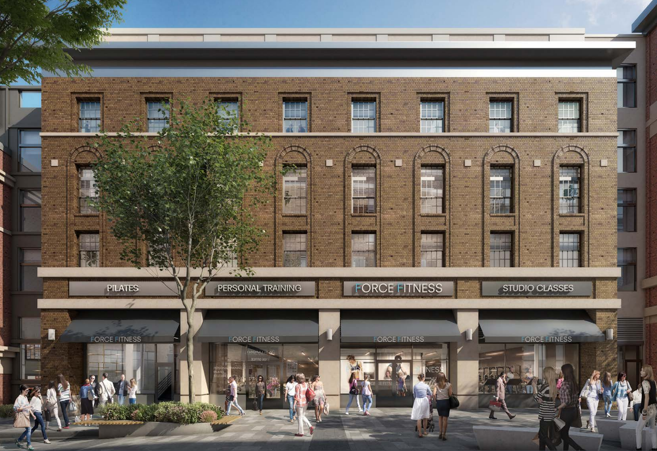
SEYMOUR STREET MONTCLAIR, NEW JERSEY