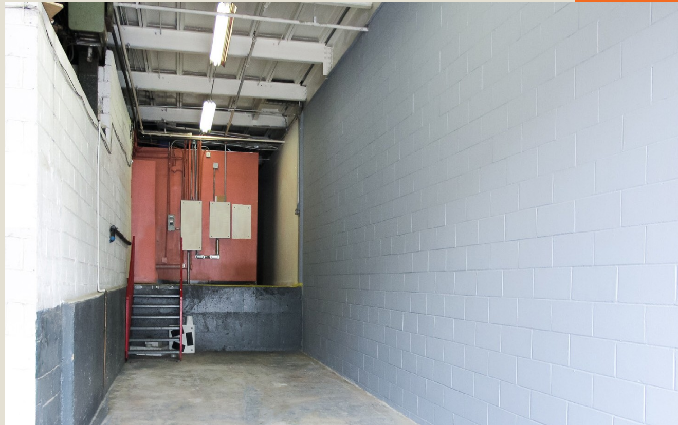
LOADING DOCK OR PARKING

For More Information, Please Contact Exclusive Agents: