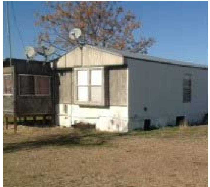
Mobile home included in purchase of North tract.