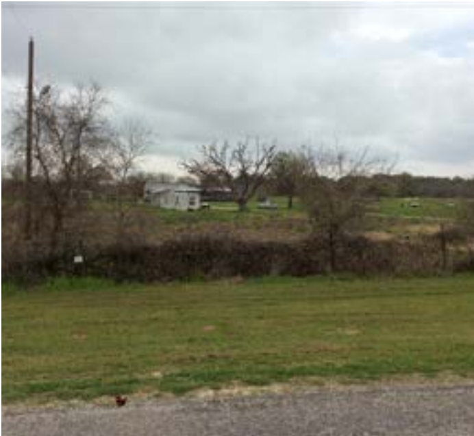
View of North tract with Mobile home.