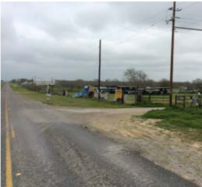
View from property looking North on Frontage Rd.