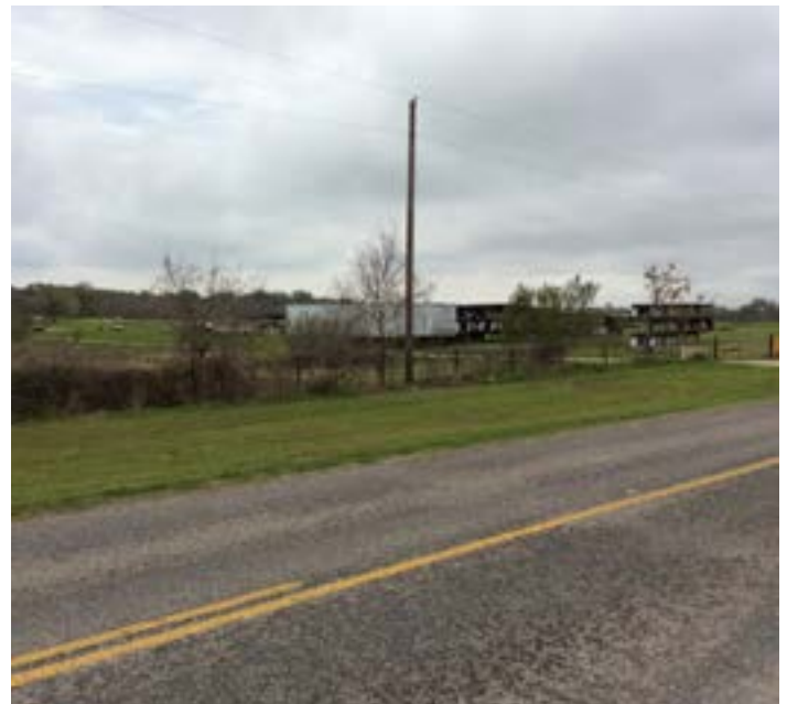
View from property looking South on Frontage Rd.

ALL INFORMATION FURNISHED IS FROM SOURCES DEEMED RELIABLE AND IS SUBMITTED SUBJECT TO ERRORS, OMISSIONS, CHANGE OF TERMS AND/ OR CONDITIONS, PRIOR SALE, LEASE OR WITHDRAWAL WITHOUT NOTICE.