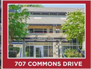
707 COMMONS DRIVE