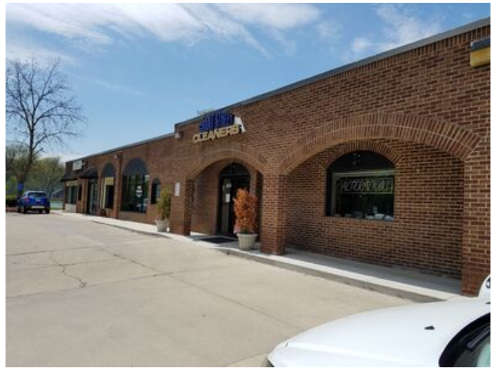
1160 Grant St