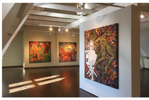
1341 N WESTERN AVE