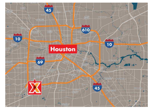
CENTER SIZE: 38,997 SF

29.692300, -95.439900 8415-8431 Stella Link | Houston, TX 77025