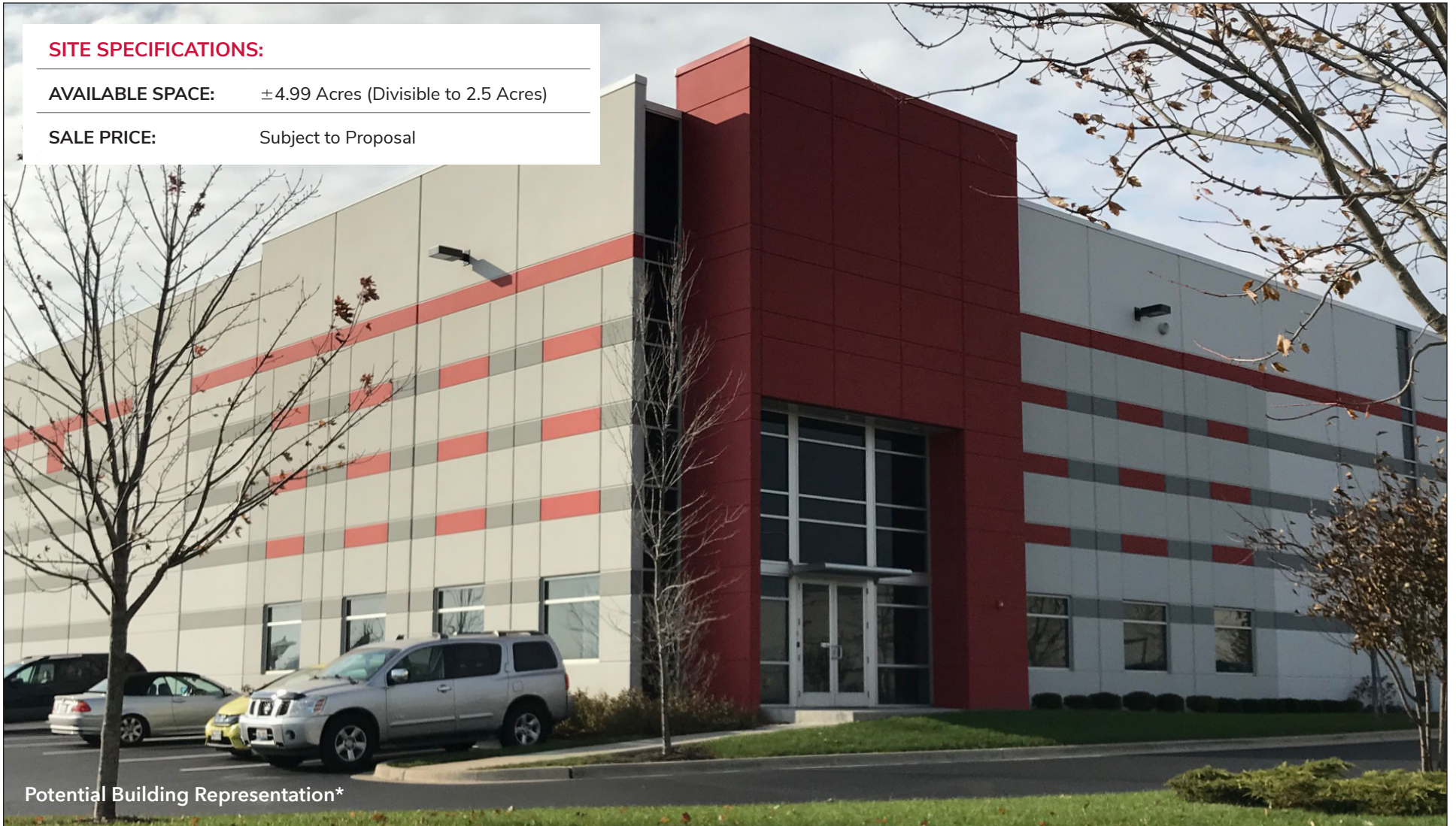
Potential Building Representation*