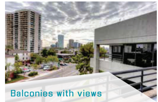
Balconies with views