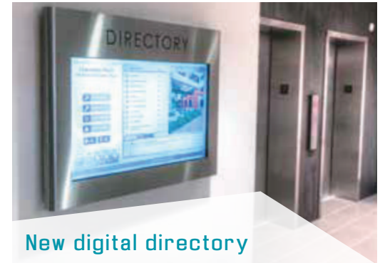
New digital directory