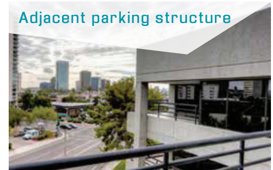
Adjacent parking structure