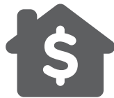
Median HH Income