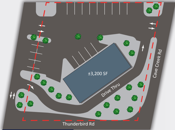
Pad Option #1