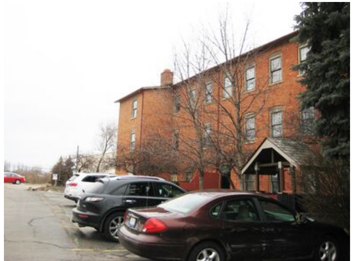
Exterior Photo 2