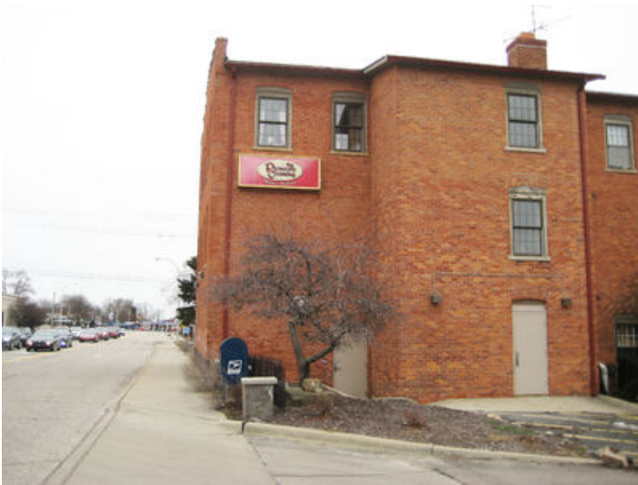
Exterior Photo 4