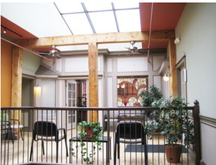
Interior Photo 1