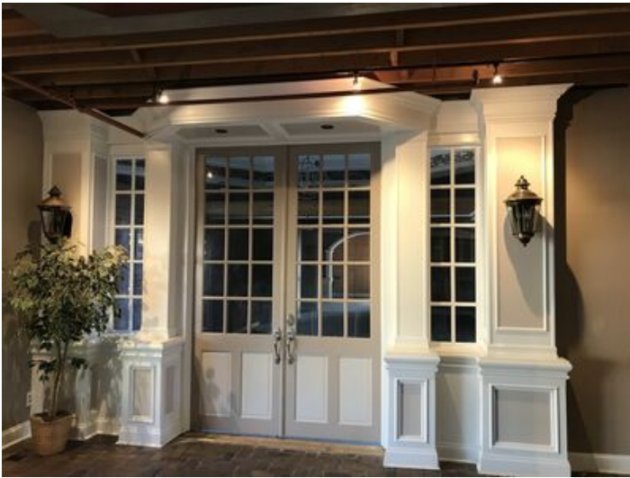
Interior Photo 4