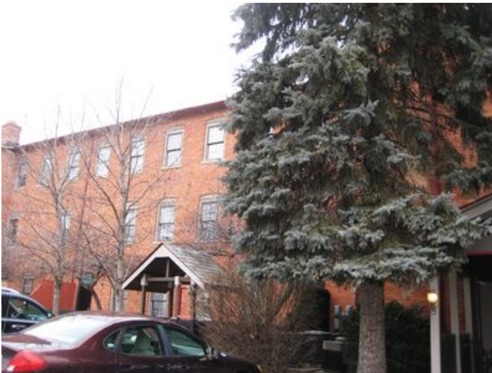
Exterior Photo 1