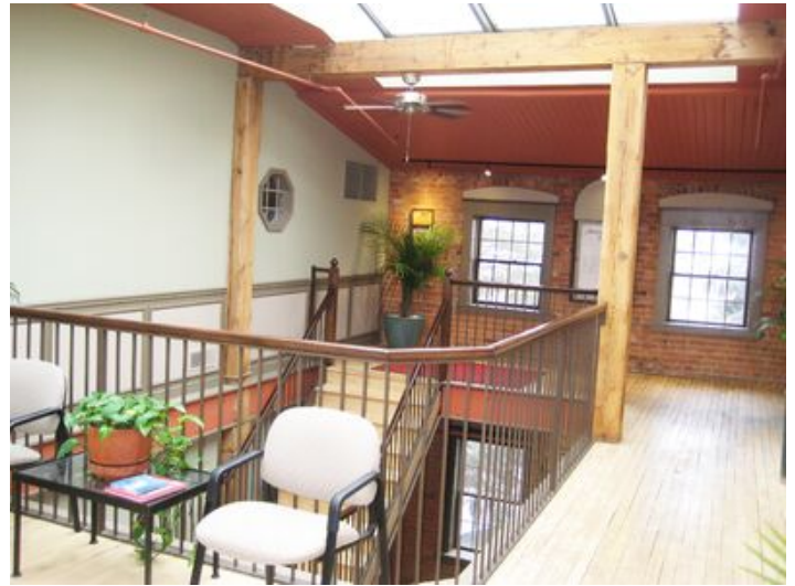
Interior Photo 2