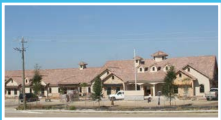
THE MEDICAL RESORT AT BAY AREA