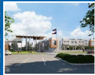
CAREER TECHNOLOGY EDUCATION HIGH SCHOOL