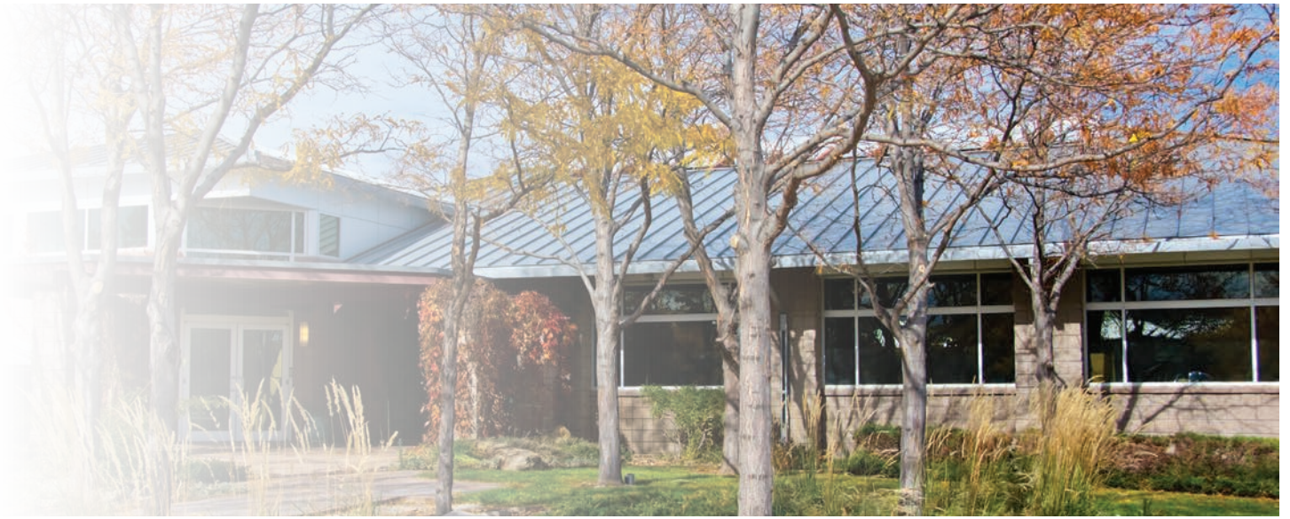
Suite 100 - 6,977 SF As-built with furniture