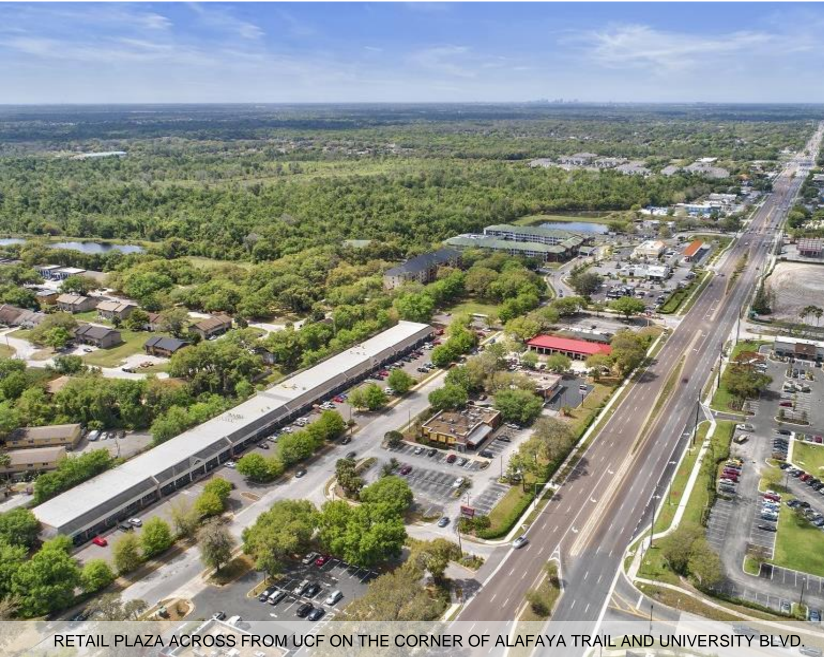
RETAIL PLAZA ACROSS FROM UCF ON THE CORNER OF ALAFAYA TRAIL AND UNIVERSITY BLVD.