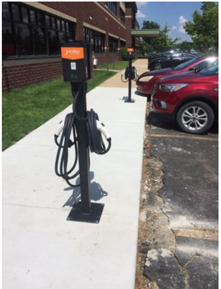
EV charging station