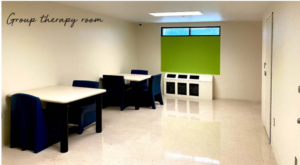
Group therapy room