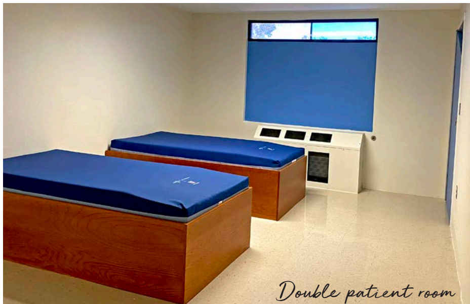
Double patient room