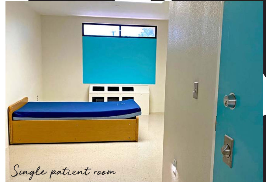
Single patient room