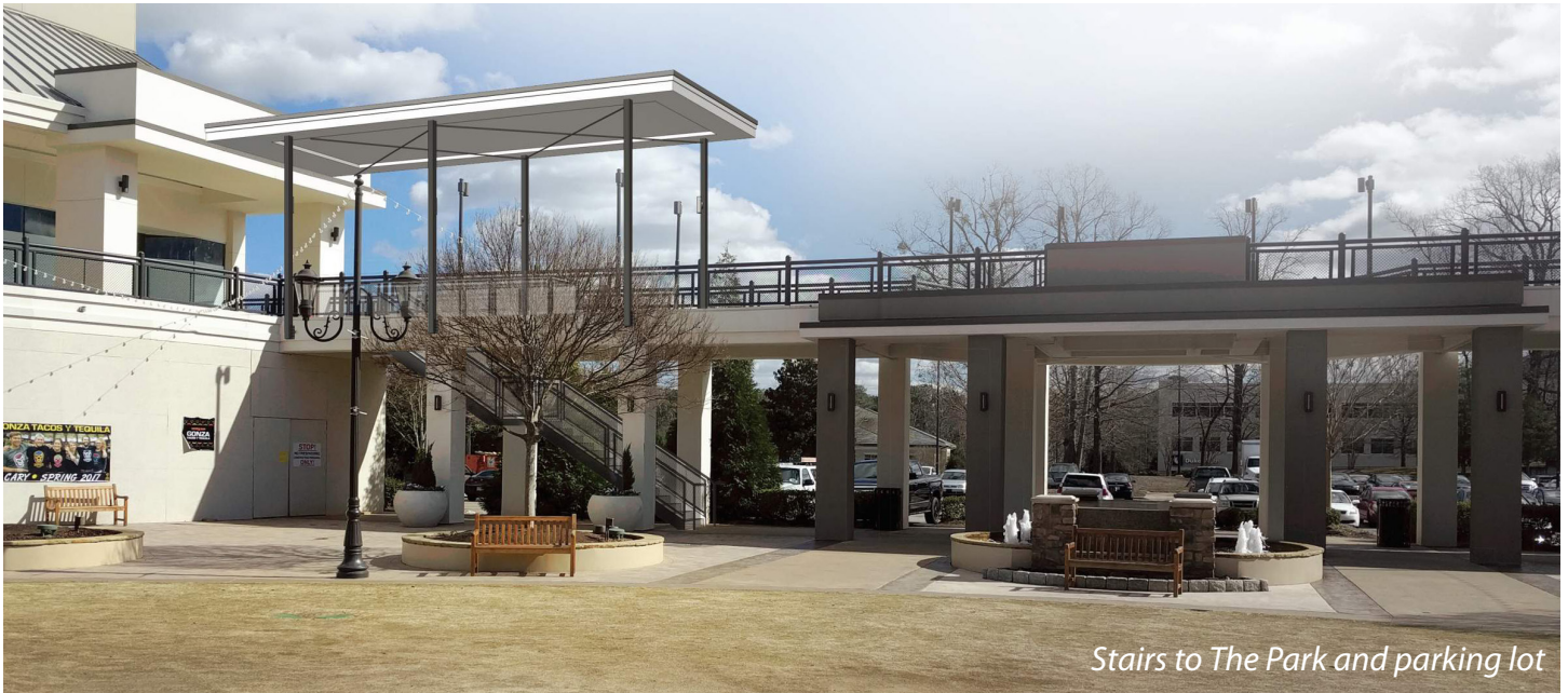
Stairs to The Park and parking lot

Planned staircase connecting second floor office space to rear tenant parking area.