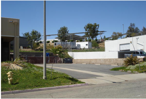
Freestanding building with separate parking