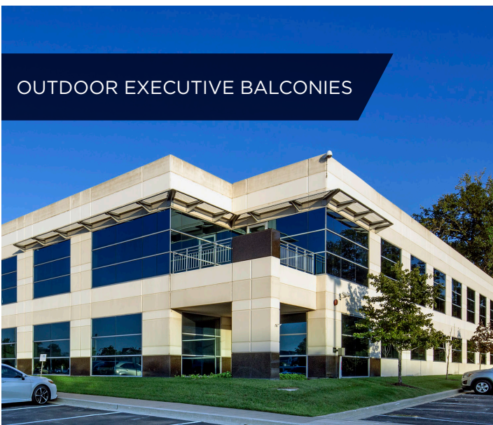
OUTDOOR EXECUTIVE BALCONIES