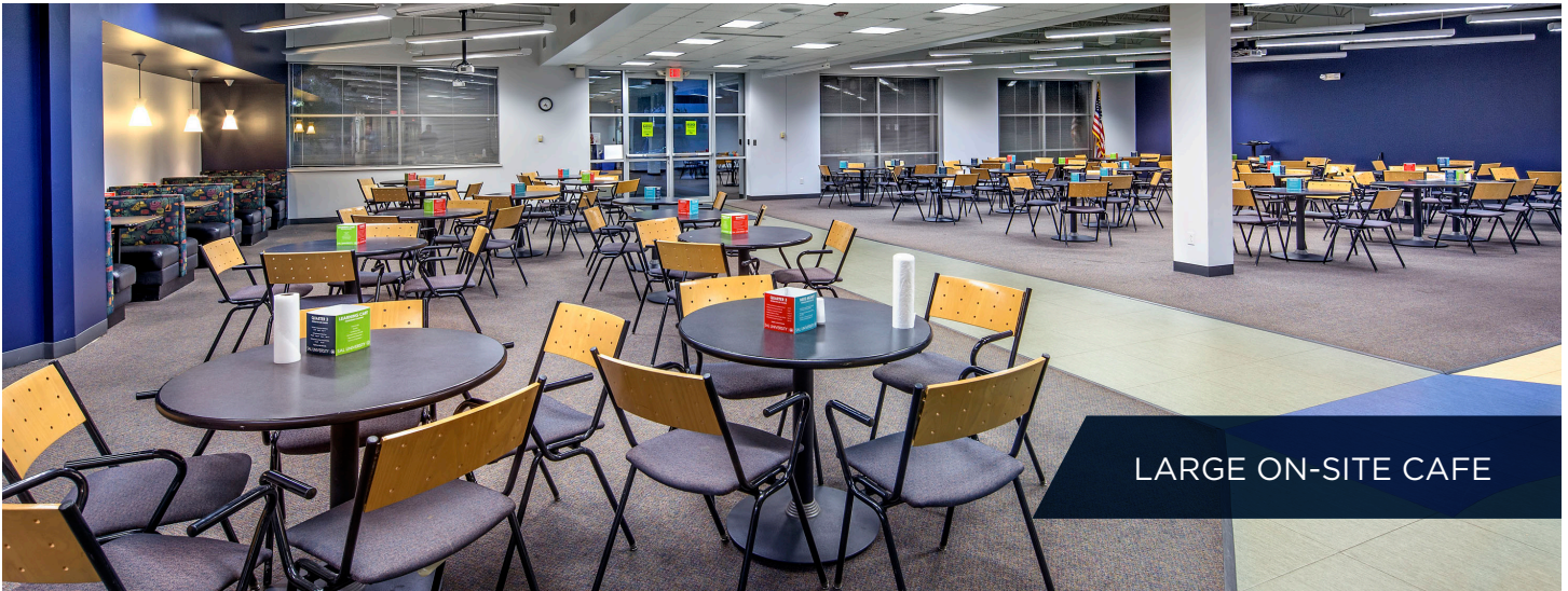
LARGE ON-SITE CAFE