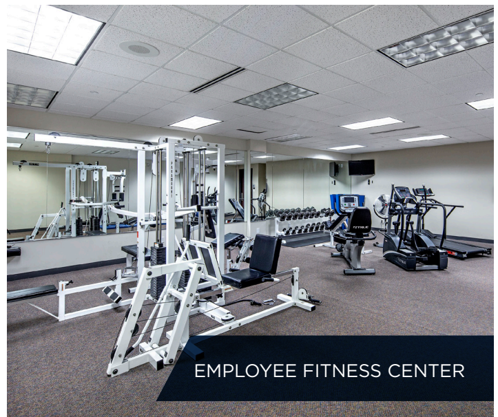
EMPLOYEE FITNESS CENTER