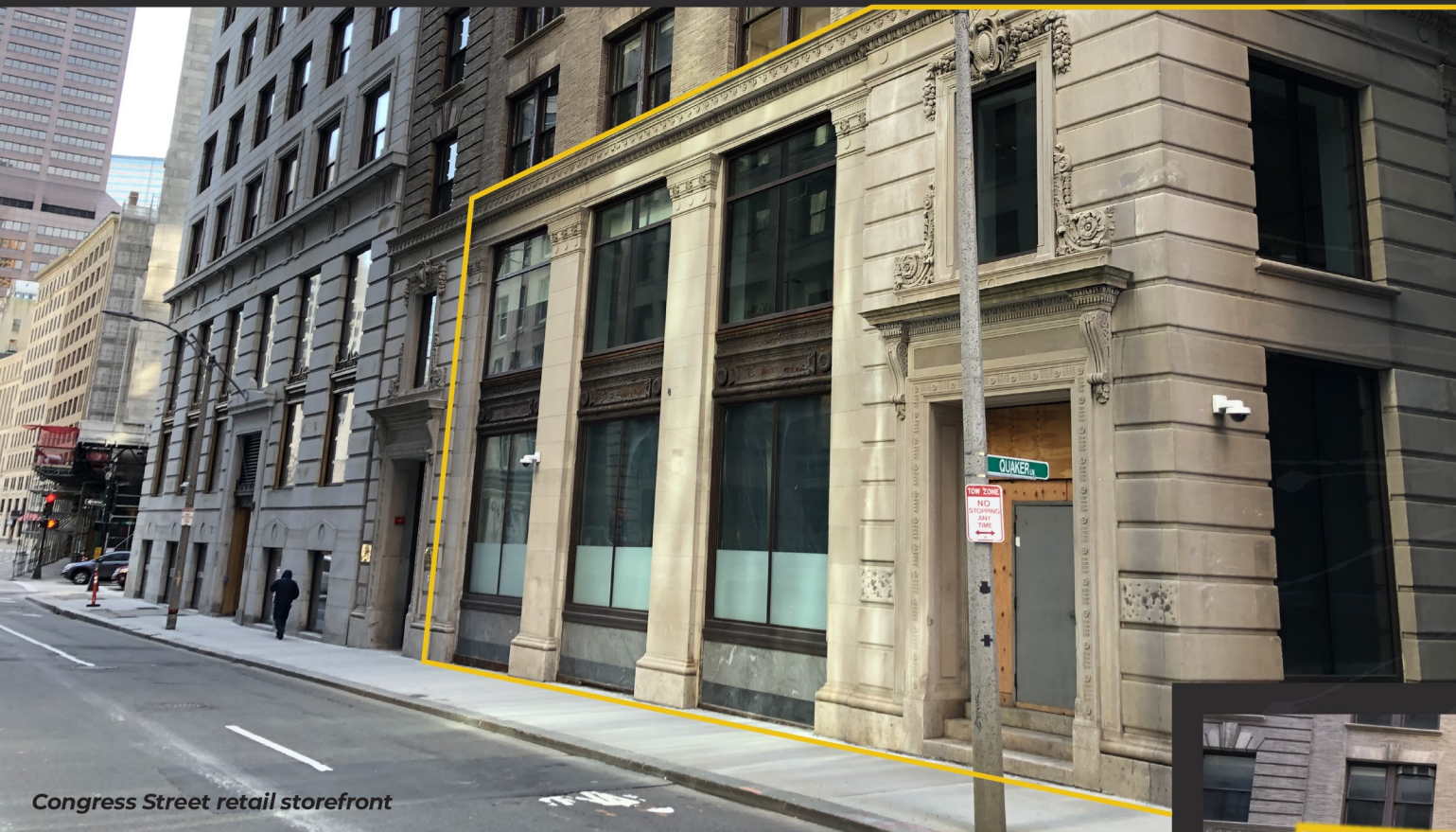
Congress Street retail storefront