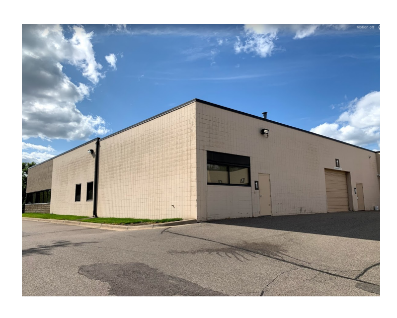
1 - Drive IN ...With the option to add one more