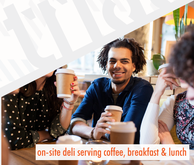
on-site deli serving coffee, breakfast & lunch