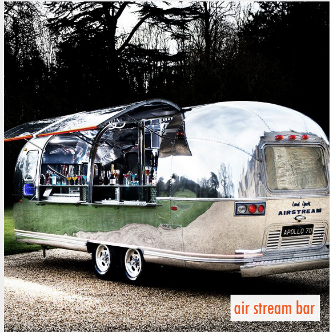
air stream bar