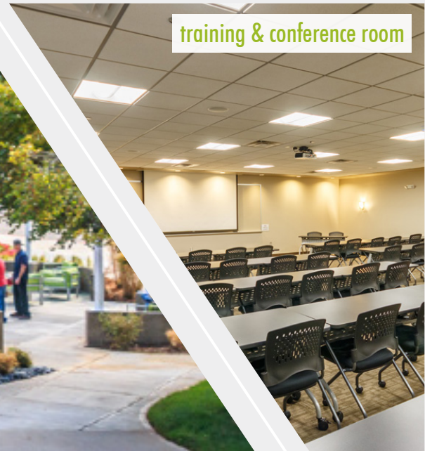
training & conference room