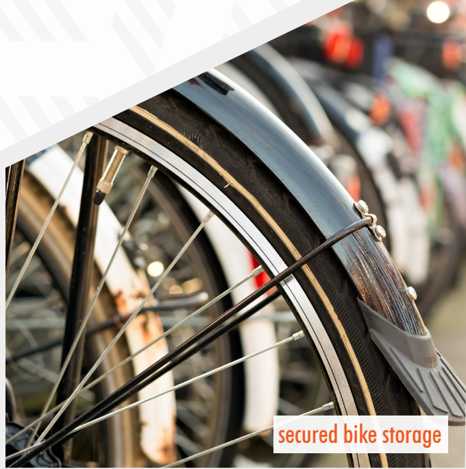
secured bike storage