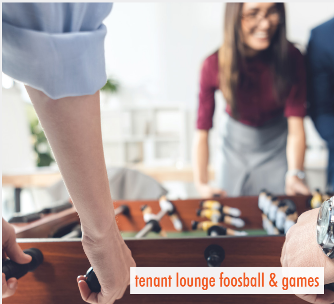
tenant lounge foosball & games