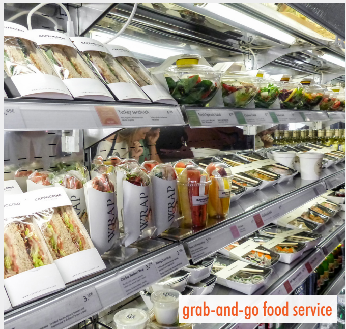
grab-and-go food service