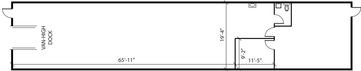
11864 DORSETT ROAD 1,900 SF