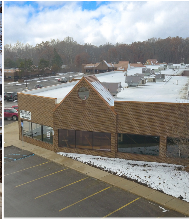
END CAP FRONTING S LAPEER RD