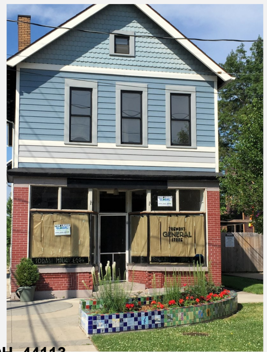
2418 Professor Avenue, Cleveland, OH 44113