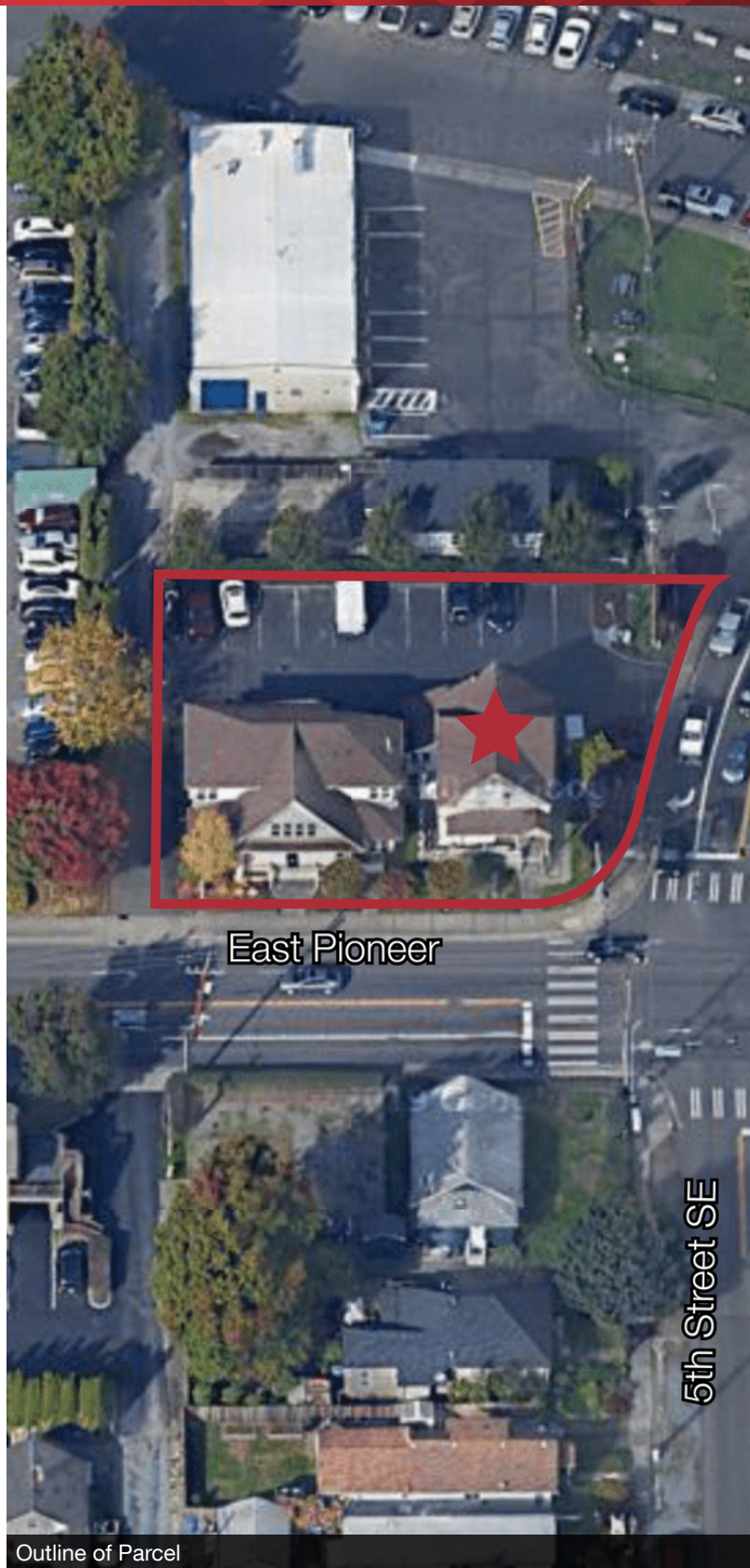
Outline of Parcel