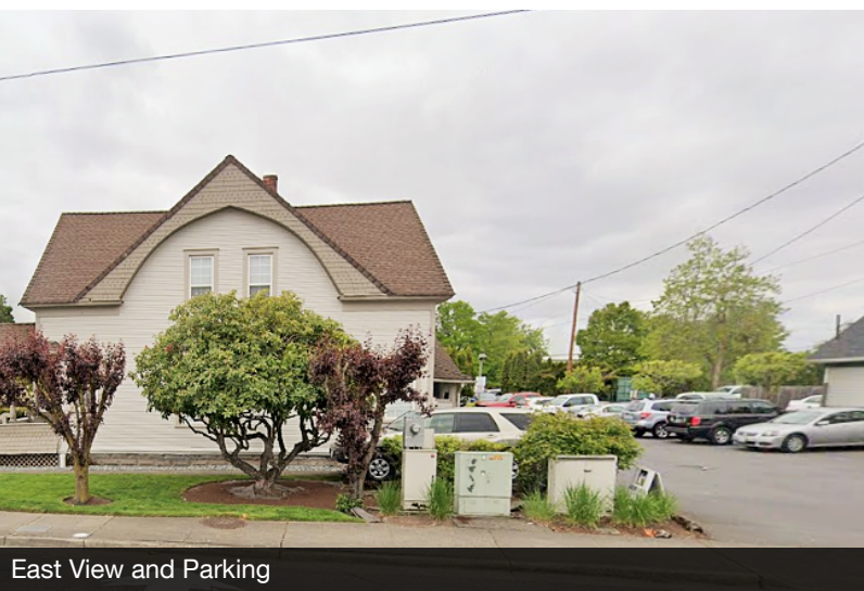
East View and Parking