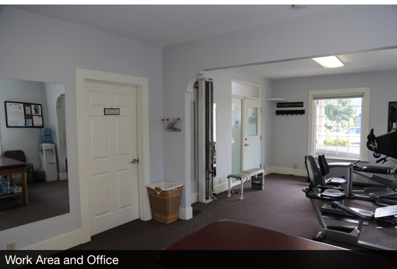
Work Area and Office