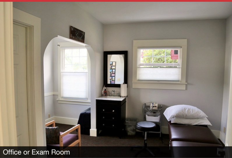
Office or Exam Room