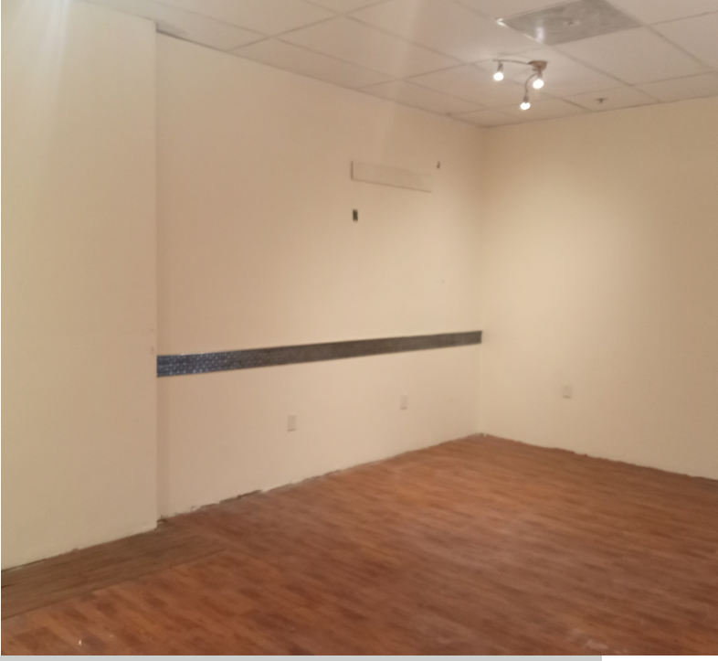
Warranty: Goodale & Barbieri Company does not guarantee, warrant, either expressed or implied, any information supplied by the Seller. Buyer should rely on his own verification of this information as a part of their own due diligence. Copyright: We respect the intellectual property of others. If you believe that your work has been copied in a way that constitutes copyright infringement please contact us immediately.

Goodale & Barbieri Company 818 West Riverside #300 Spokane, WA 99201 www.g-b.com