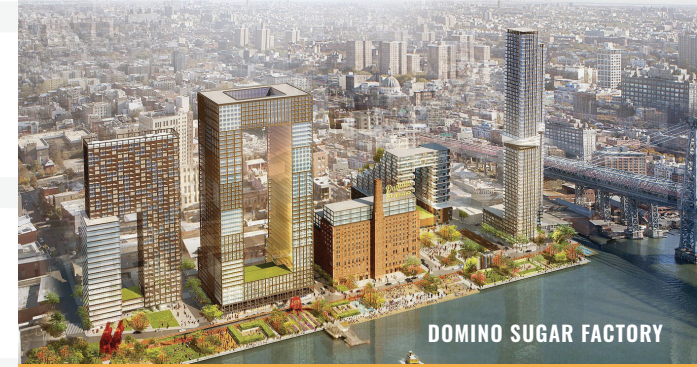
DOMINO SUGAR FACTORY

BEDFORD AVENUE L SUBWAY STOP 9,892,516 RIDERS ANNUALLY