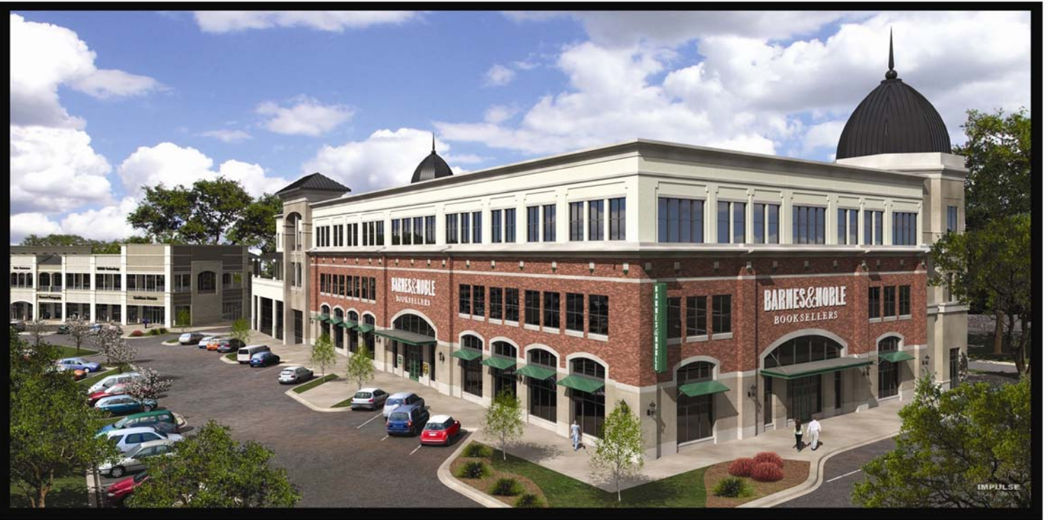
Building 500 Elevation