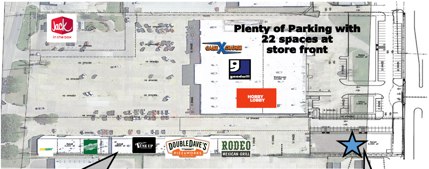
OVERALL PARKING PLAN