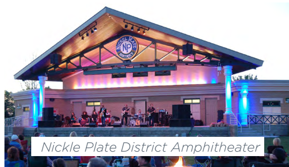
Nickle Plate District Amphitheater