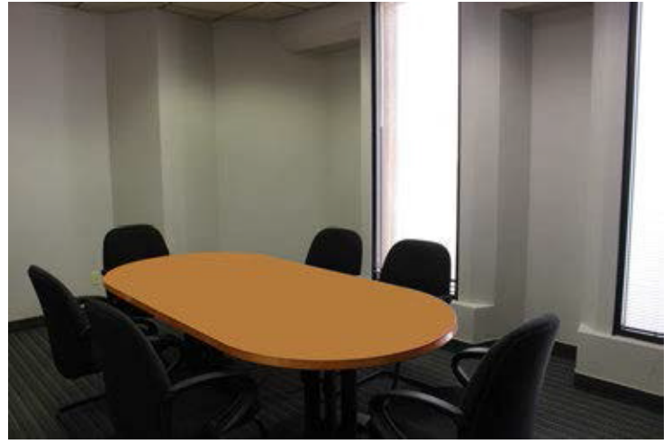
Warm, Welcoming Lobby with Common Area Conference Room