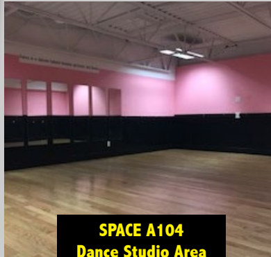
SPACE A104 Dance Studio Area Upstairs - 25' x 18' Main Level - 33' x 25'